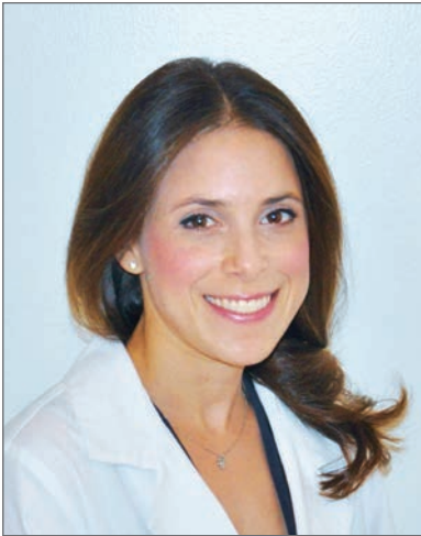
By Lauren Geller, MD

Common warts, also called verrucae vulgaris, are skin growths caused by human papilloma virus (HPV). This problem can occur at any age but is especially prevalent among young children and adolescents. Warts are spread by contact with infected people or contaminated objects and surfaces. Although warts are not highly contagious, there are exceptions, for example, when barefoot children or teens use public swimming pools and locker room facilities.